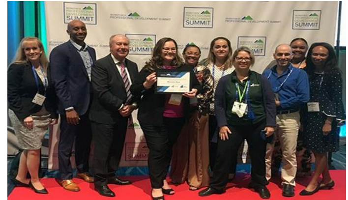
CSBD At The Florida State Summit